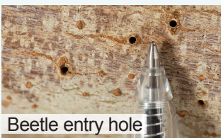
Beetle entry hole